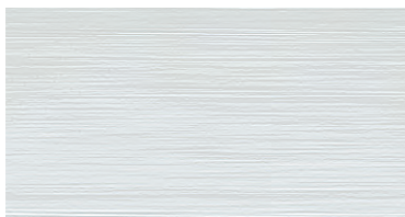
FLUSH PANEL WITH WOODGRAIN EMBOSSMENT